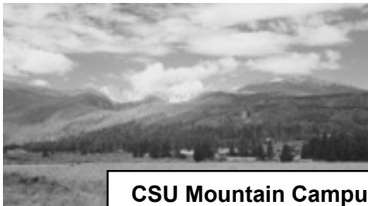
CSU Mountain Campus