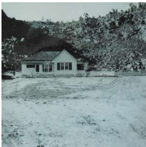
Ranch house where the Fullertons lived