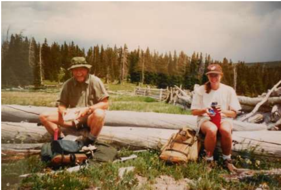
Hikers having lunch at what was left of the Brackenbury cabin and corrals near Brown’s Lake, 1995