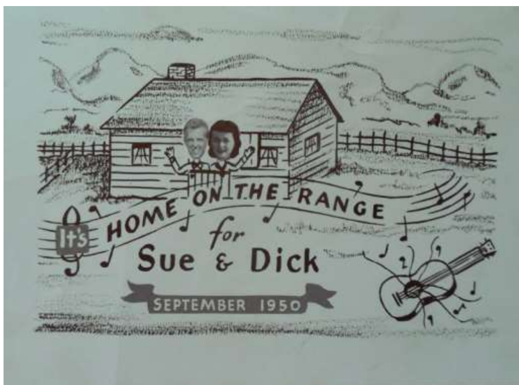
Wedding bells and announcements