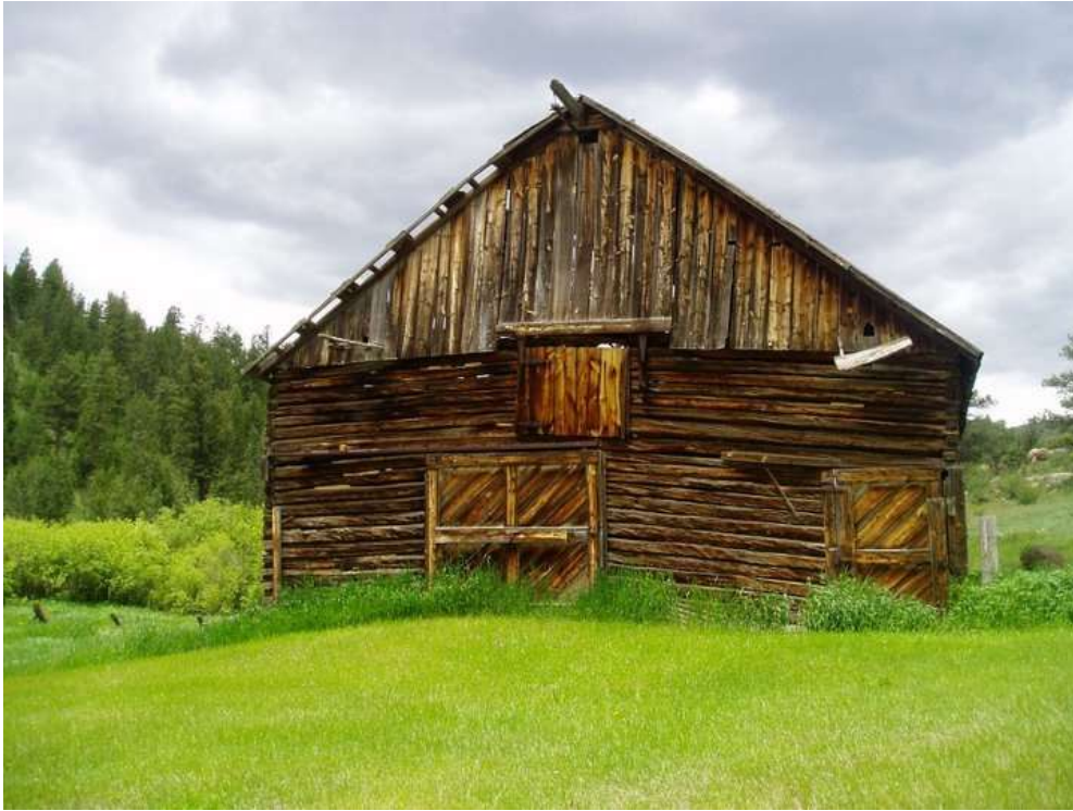
The “elephant barn” at the Upper Brackenbury Ranch (Pat Clemens)