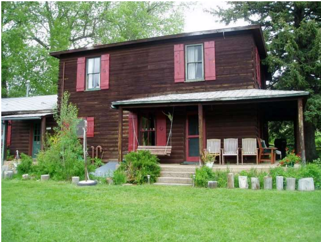
The “ghost house” at the Upper Brackenbury Ranch after it was log-sided