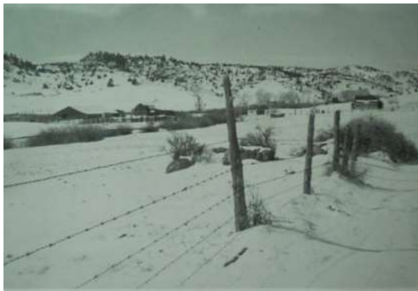
Lower Brackenbury Ranch in winter