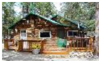
HISTORIC SITE RAFFLE CABIN 1928-2018

Share them with the Red Feather Historical Society