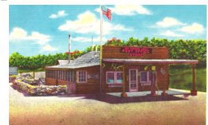
Red Feather Lakes Trading Post Built in the 1924