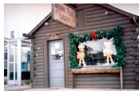
REAL ESTATE OFFICE & ICE HOUSE Built in the 1920'S