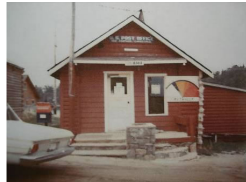
Red Feather Lakes Early Post Office Built in the 1920's