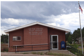
RFL POST OFFICE Built in 1968