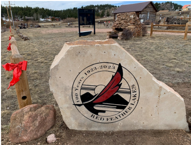
Red Feather Lakes 100 Years 1923-2023 Celebration Rock