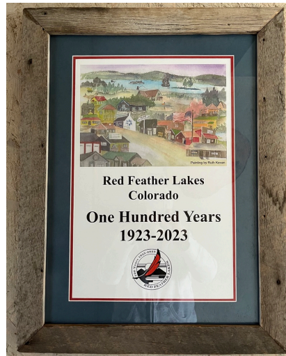
One Hundred Years Poster $10.00