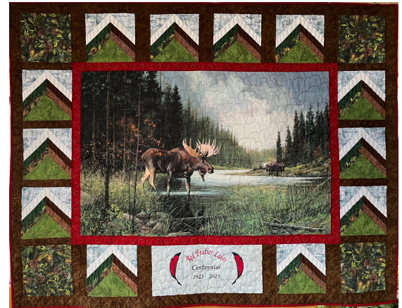
Wall Hanging or Throw Size 64"W X 48"L Donated by "Meadow Mountain Quilters" Suggested donations are $2.00 each or 6 tickets for $10.00 Drawing will be in September 2023